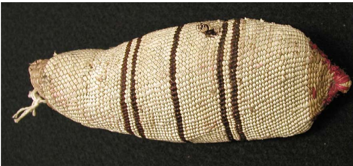
Rattle at Olympic National Park made of surf grass

According to Andrews and Putnam (1999:12) it is Phyllospadix scouleri that is used for wrapping wefts. "When worked into a basket, bleached surf grass is more or less bone white, lighter in color than either bear grass or swamp grass; unbleached it can turn dark brown. Surf grass is not common in later baskets." Early baskets were sometimes woven entirely from the bleached sea grass, such as the rattle seen here.