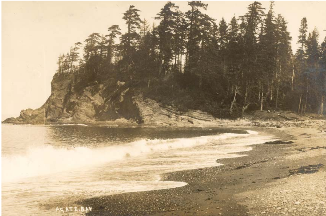
Agate Bay Historic Photo