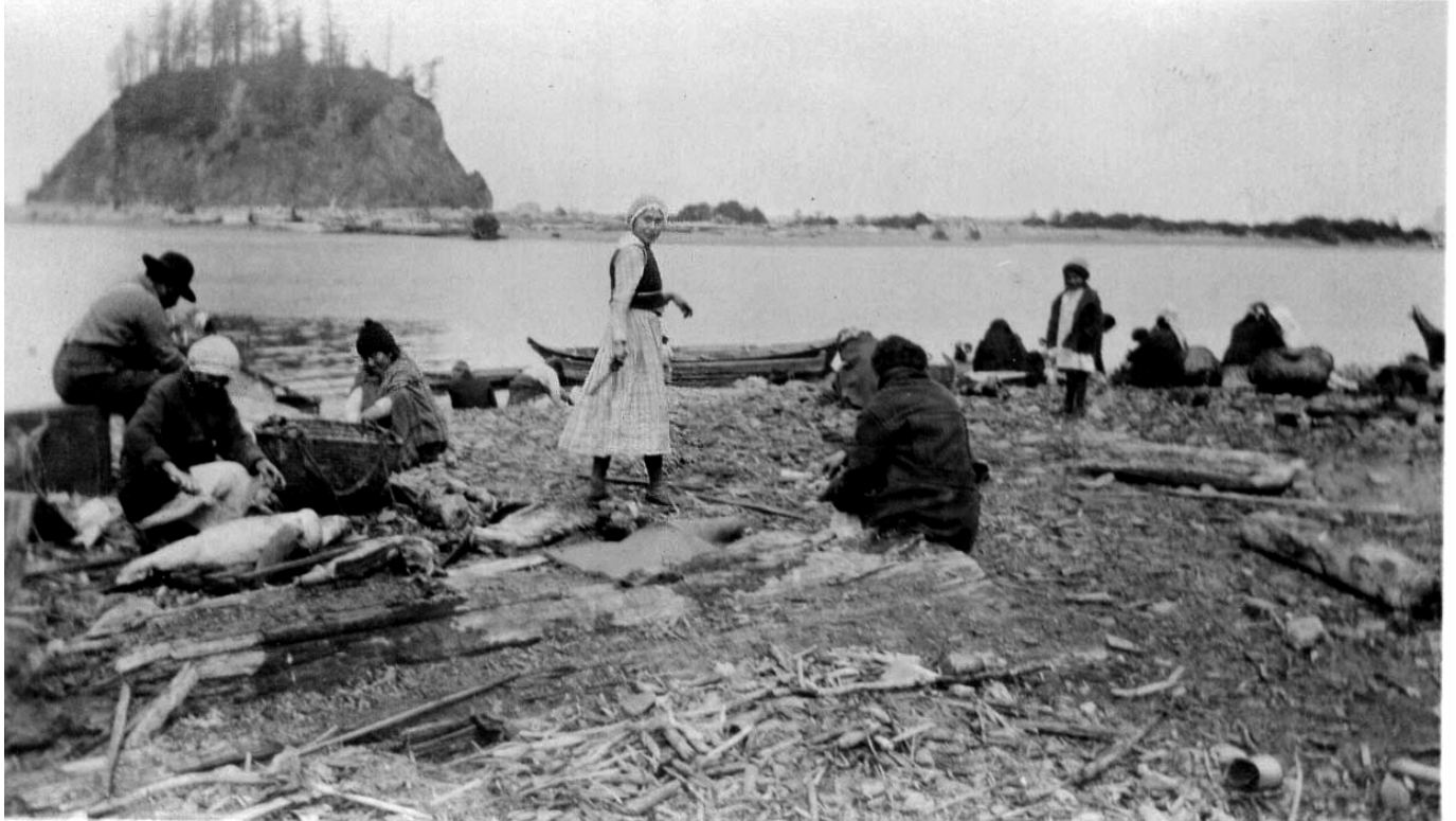
Along the nearshore at LaPush, circa 1915