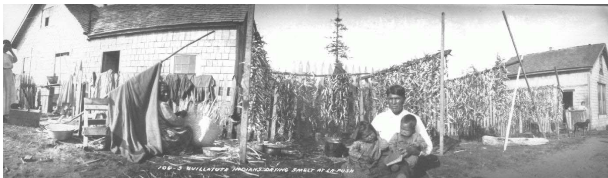
"Quillayute (sic) Indians Drying Smelt at La Push", circa 1915