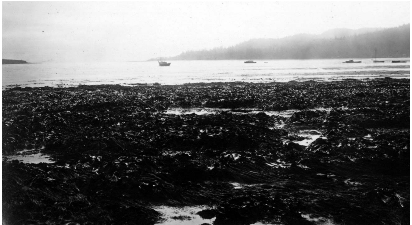
Porphyra on beach, Waada Island at left

The Quileute visited the Ozette area during social occasions, and while there they sometimes harvested kelp and different species of seaweed, laminarias, and alarias. Porphyra was also collected at Ozette and was eaten like nori.