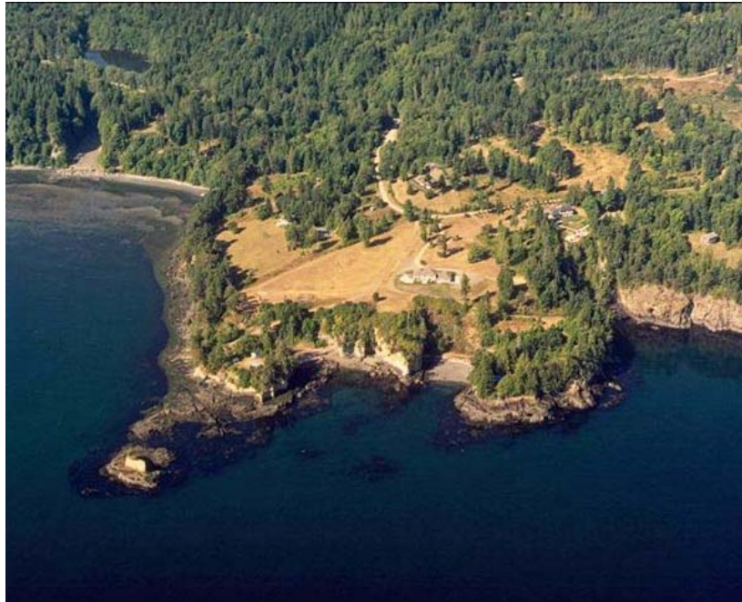
Observatory Point, Freshwater Bay to left