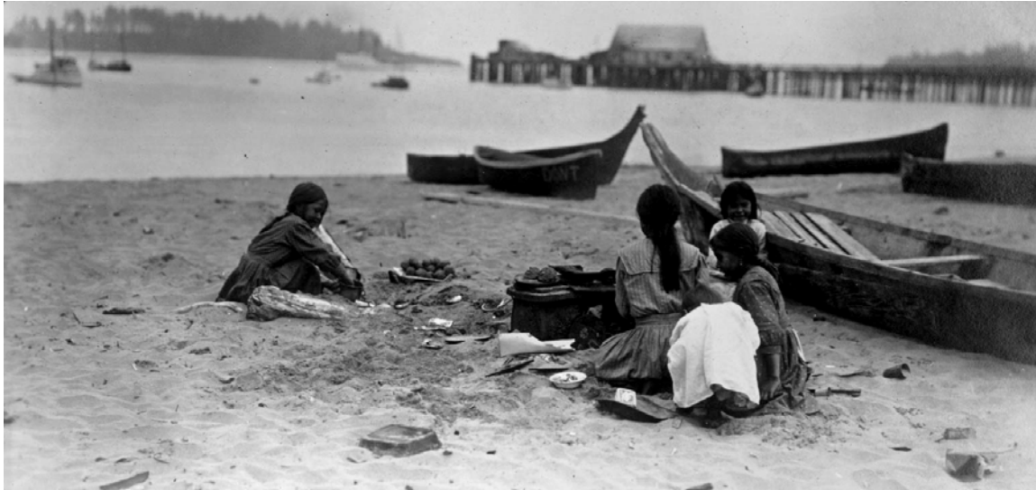
Girls on beach at Neah Bay