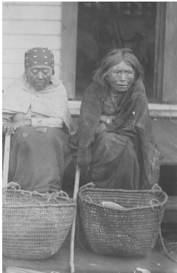
Carrying baskets and digging sticks

Women often did the clam digging, carrying them on their backs in a large burden basket with a tumpline. The basket was open-weave of split vine maple, or spruce or cedar root that allowed water to pass through. A clam digging stick of hard wood with a pointed end and a straight handle, sometimes with a knobbed grip, was used to dig clams. The clam-digging stick was different from the root-digging stick, which had a curved handle for maneuvering the wrist to cut through the roots. Although clamming is often viewed as a female occupation, gathering activities were not stigmatized for men, although men "seldom did it in traditional times" (Powell 2003:5). After the turn of the century, clam digging became more of a family activity and men joined in; "but Hal George and Chris Morganroth II agreed that women dug the clams in the old days" (Powell 2003:5). Vi Riebe remembers the men going "out in a canoe on a good day at minus tide" to get china slippers (chitons) from the offshore rocks.