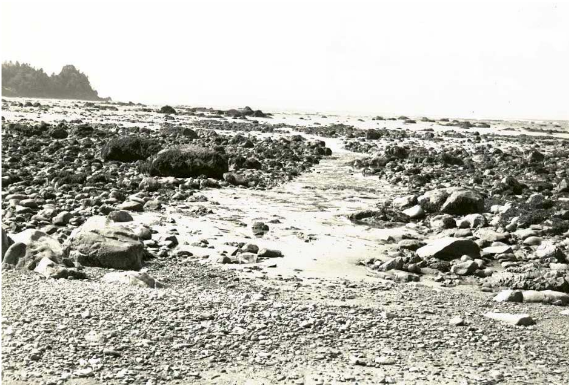
Canoe run at Ozette Village Olympic National Park