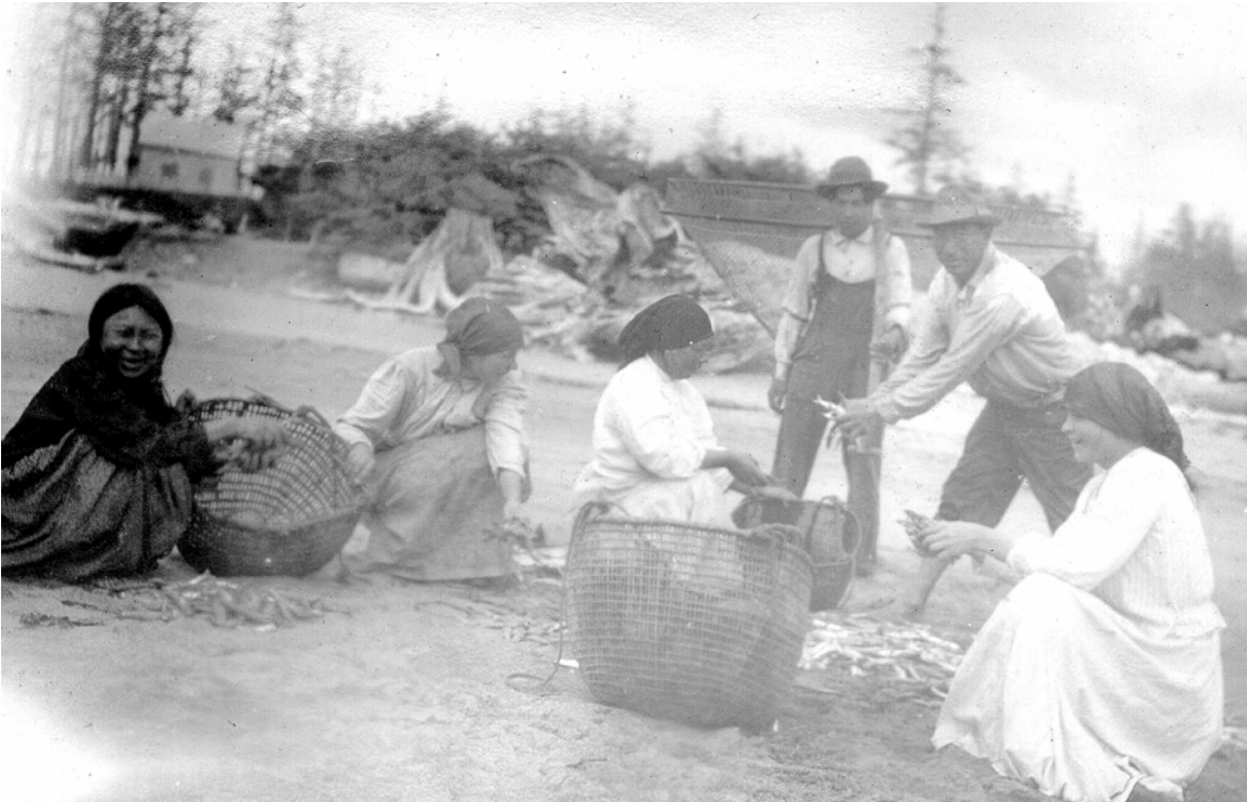
Sorting harvested smelt at LaPush, circa 1915