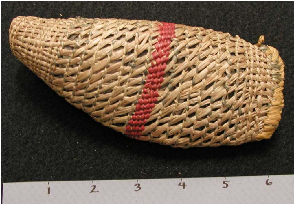
Mussel shell rattle at Olympic National Park

Cedar trees along the shoreline were used for all types of utilitarian purposes, but one that Jay Powell has highlighted must be mentioned here. "Often when the old people had gone up the creeks and gotten so many fish that they would swamp a canoe, especially humpies, they would string the fish on long cedar bark stringers (10-15 feet long, holding dozens of fish each), which would float along in the water beside the canoe, and the canoe would be buoyant with lots of free-board." Hal George told Powell that "you could see little yellow flashes continuously while paddling along the coast. These were the patches where bark had been harvested from individual trees" (Powell 2004).